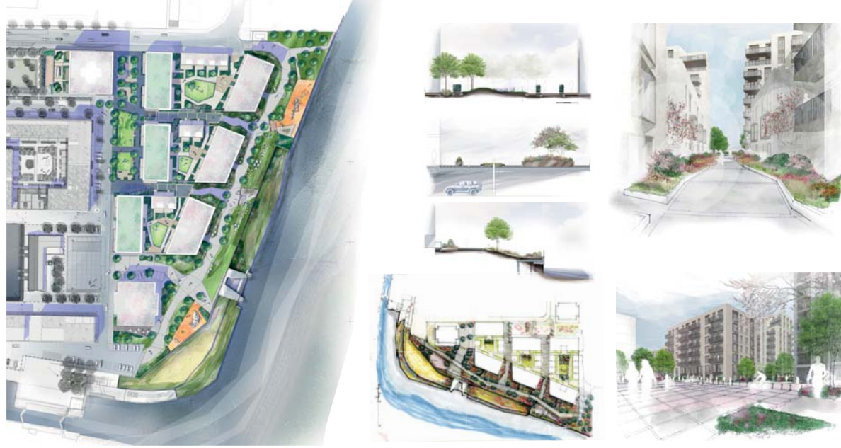
Great Eastern Quay, Phase 2, London 465 residential units and over 5000m 2 of associated landscape