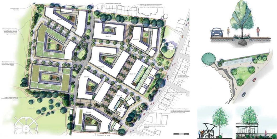
Hounslow Civic Centre, Redevelopment of the Civic Centre site within a network of open spaces and shared surface streets associated with the new council offices and residential development